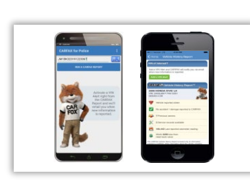
CARFAX<sup>®</sup> Mobile Application