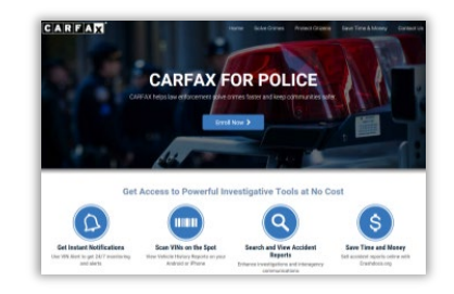
CARFAX For Police<sup>™</sup>