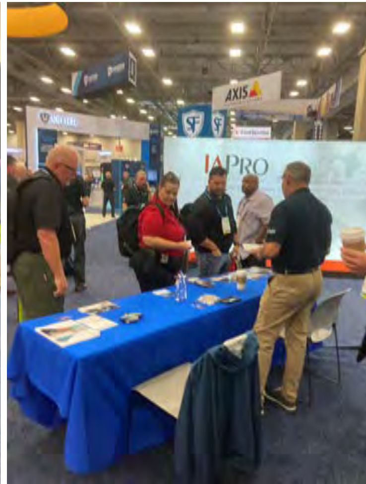
IACP 2022-Dallas, Texas